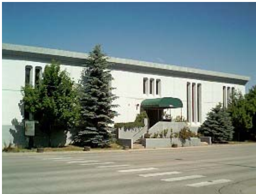
The old Federal Building in Downtown Durango will soon be "The Commons" hosting at least ten non-profits.